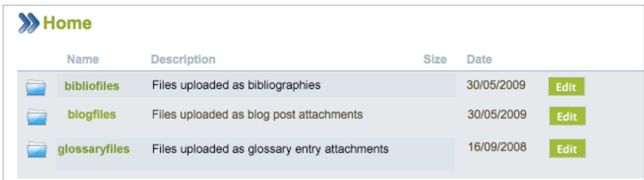
Image 2: Automatically created folders for glossary and bibliography files